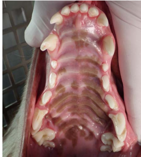
The well-proportioned and constructed maxilla of a border collie (6533)

www.toothvet.ca/PDFfiles/pericoronitis.pdf