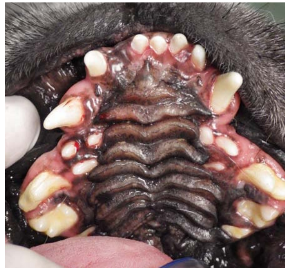
A horribly deformed, distorted and diseased maxilla of a pug (6500)