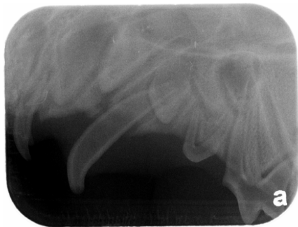
And the radiograph shows that the large pulp chamber with a wide-open apex and on open crown means that this tooth can act as a drain, letting infection in and drainage out. No Abscess here.

In time, the apical periodontitis may fenestrate through the alveolar bone allowing sepsis into the facial soft tissues. This results in an acute