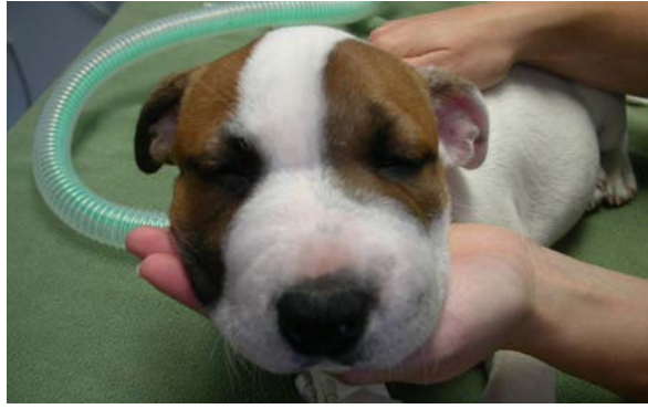
A puppy with an acute facial cellulitis.